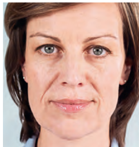
Before treatment (all photos unretouched)

Restoring facial volume with fillers (such as Juvederm® or Restylane®),